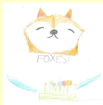
Foxes Class winning entry - Olivia