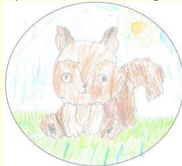
Squirrels Class winning entry - Alfie