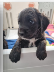
4 weeks old