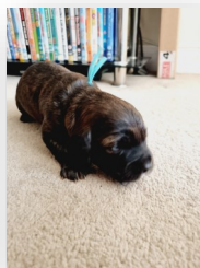
1 week old

Graveley C of E Primary School Pupil Parliament