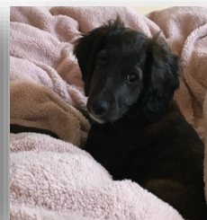
12 weeks old

Graveley C of E Primary School Phone: 01438 357377 Ashwell Common Email: admin@graveley.herts.sch.uk Graveley, Hertfordshire SG4 7LJ